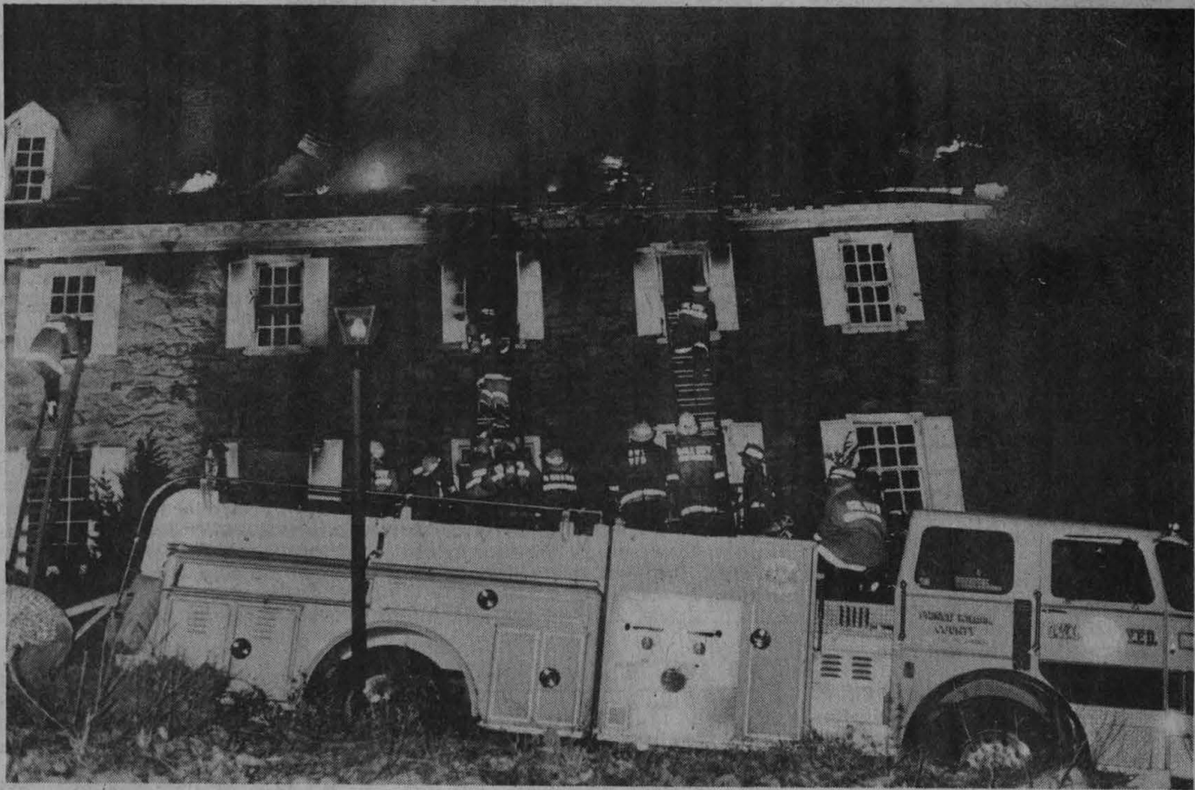
Fireman scale ladder while trying to control the rampant fire